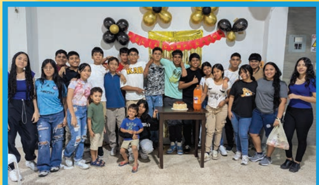
leads a Bible study; Like a family, the youth group celebrates a birthday.